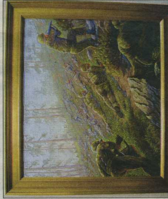
Four of 42 original paintings depicting a number of Vietnam battles, as well as one bronze statue of a Vietnam soldier — all by artist/sculptor Gregory Perillo — will be on permanent display at the New Jersey Vietnam Veterans Museum and Education Center in Holmdel.