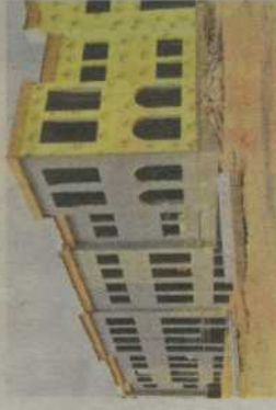
Construction of a Meridian Health medical mall nears completion in Jackson.