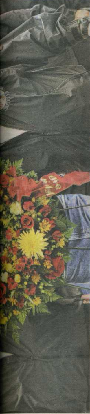
Vietnam veterans present a wreath during New Jersey Vietnam Veterans' Memorial Foundation Remembrance Day Tuesday, honoring all those who served in the military during the Vietnam era from 1959 to 1975.