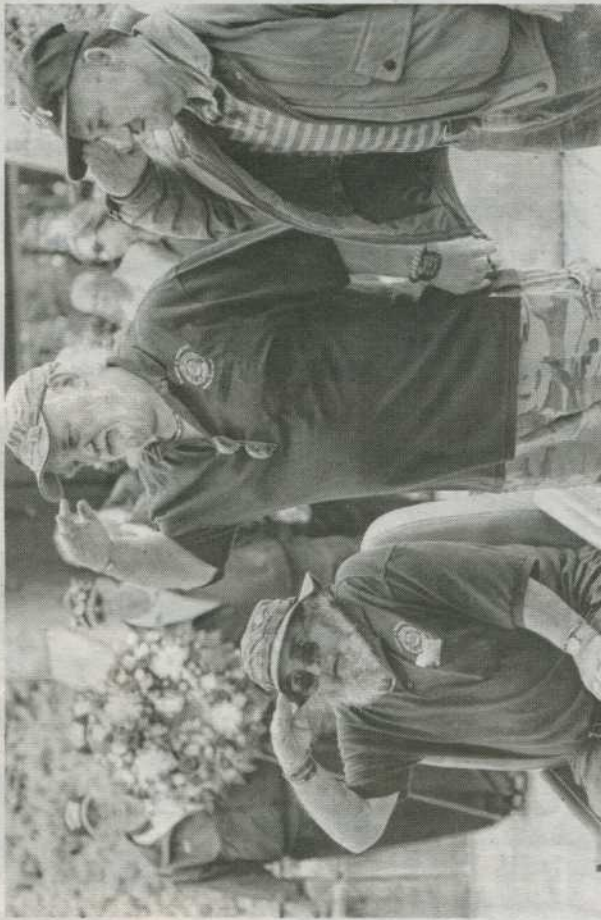
Vietnam veterans salute after presenting a wreath during the ceremony, held by the New Jersey Vietnam Veterans' Memorial Foundation.