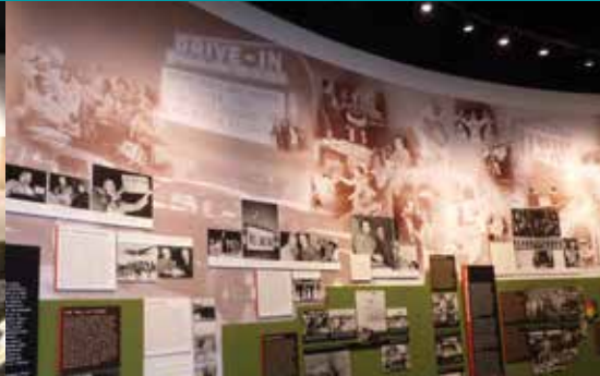
Sepia Mural After Restoration