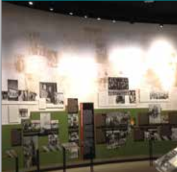
Sepia Mural Before Restoration