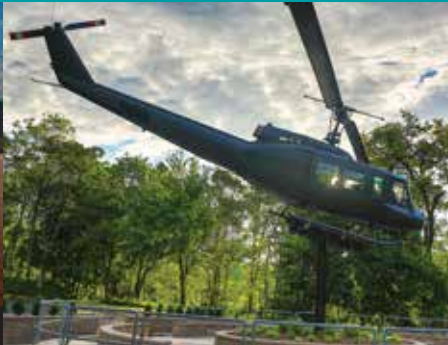
Restored 1964 Huey Helicopter

CHECK LINE 61 ON YOUR NJ INCOME TAX FORM