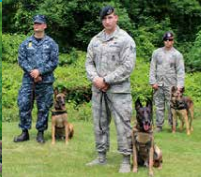
Military Working Dogs and Handlers