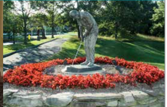
Eagle Oaks Golf & Country Club