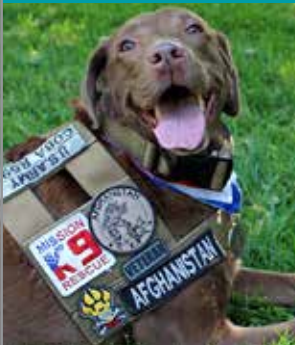
Retired Military Working Dog