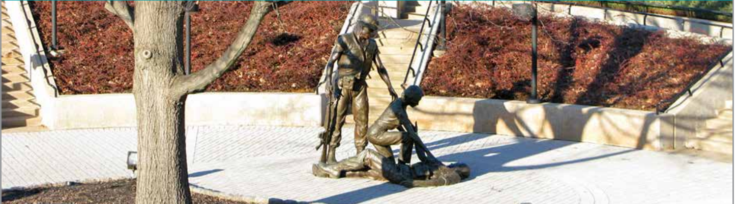
Winter at the Memorial