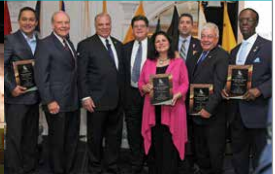
Salute to Patriotism Gala